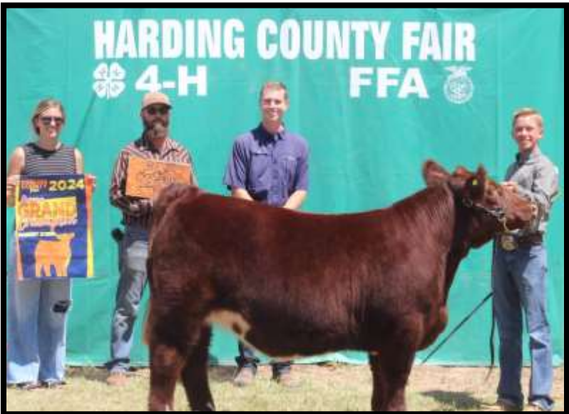
Reserve Champion Steer Brigz Bel I